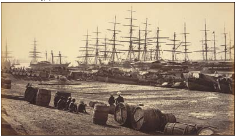
Indentured labourers waiting at Calcutta for ships

Brisbane City, pleased to be associ- Capt Cromarty, of S S Penguin, a New